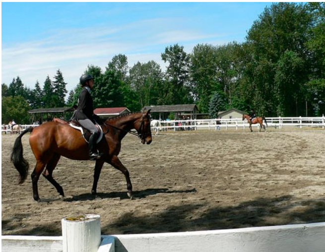
Major Ruckus (above and below)

These recent pictures and messages from Gord and Zim's family are a heart warming example of retired racehorses becoming loved and trusted family members. These two guys have found a permanent loving family home through our New Stride Adoption Services. This is what we aim to do for all the horses that are donated to New Stride. In the letter accompanying the pictures, the family states that the people at the horse show were very impressed with the fact that Gord and Zim ex-racehorses and showered them with lots of positive comments. The little girl's grin as she holds up her blue ribbons says it all. New Stride continues to survive, rehabbing, retraining and adopting our beautiful Thoroughbred racehorses.